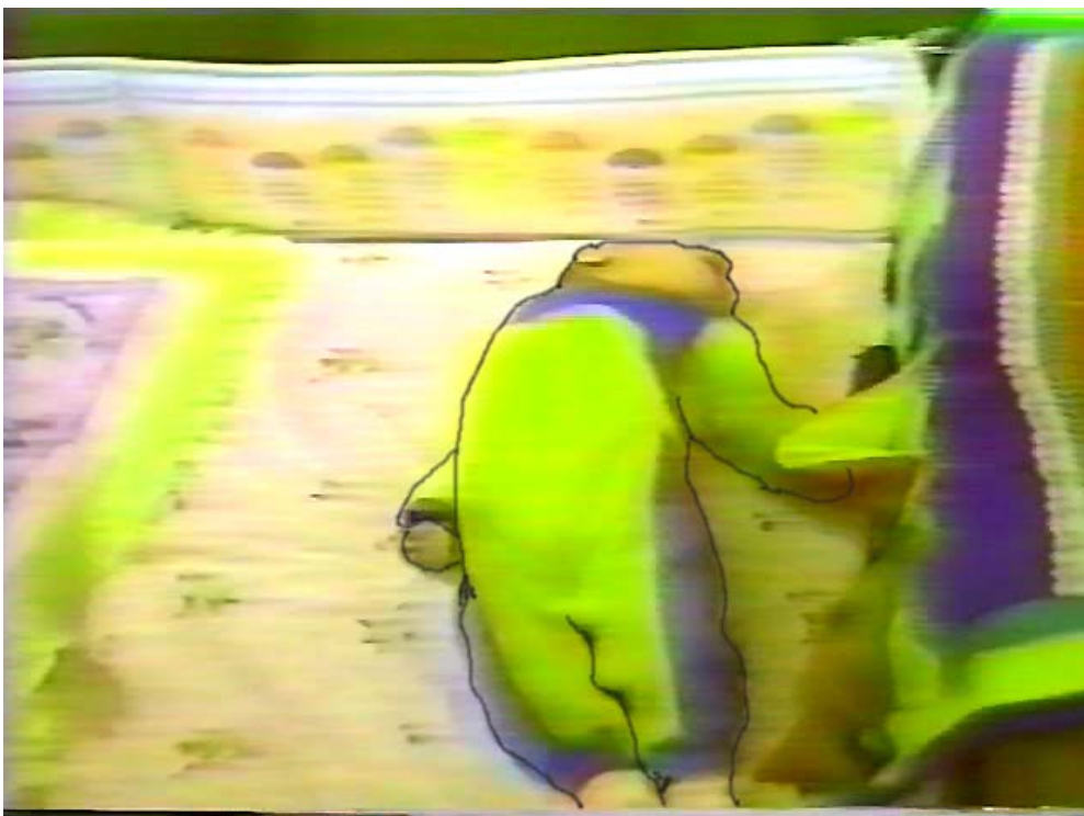
Figure 2. The Asperger's infant arches its back, in preparation for turning over.