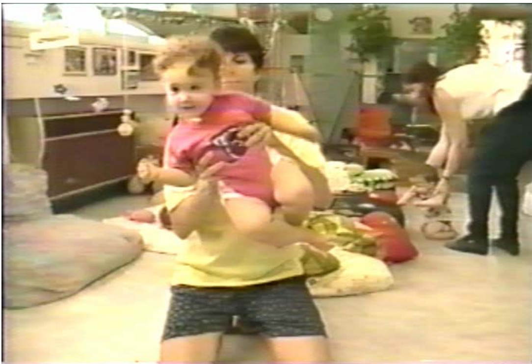
Figure 6. (Top) The “tilting test” in a normal 6-months-old child. The head and body are held in the vertical position. (Bottom) The child’s body is slowly tilted about 45 degrees to the child’s right. The child maintains its head in the absolute vertical, rather than remaining in line with the midline axis of the body. The slow tilt is then repeated toward the other side, and the normal baby will again maintain its head in the vertical. In a subgroup of autistic children, the head remains in line with the midline axis of the tilted body, rather than orienting itself to the absolute vertical, on one or both sides of body tilt.